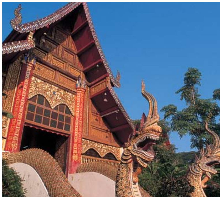
Wat Phra Kaeo

This scenic river is a major transportation artery from neighbouring Chiang Mai province, especially the town of Tha Ton. The river runs some 130 kilometres through the heart of Chiang Rai passing on its way several hilltribe settlements and elephant