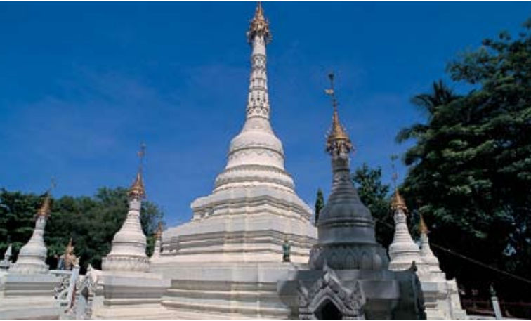
Wat Sa Bo Kaeo