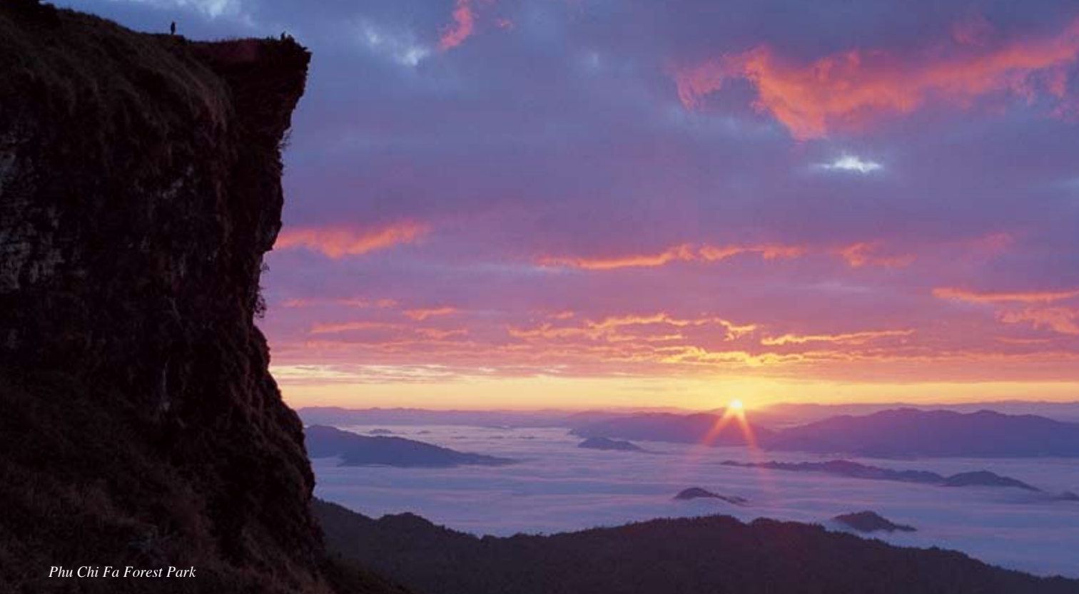
Phu Chi Fa Forest Park