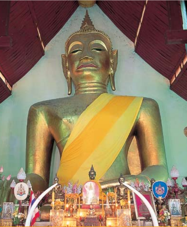
Phra Chao Ton Luang, Wat Si Khom Kham