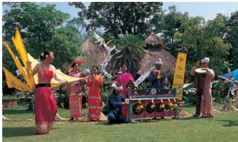
Toking Kingkala, a Local Dance

Chiang Rai is rich in handicrafts such as handwoven cotton, hilltribe silver ornaments and woodcarvings. Agricultural prod-