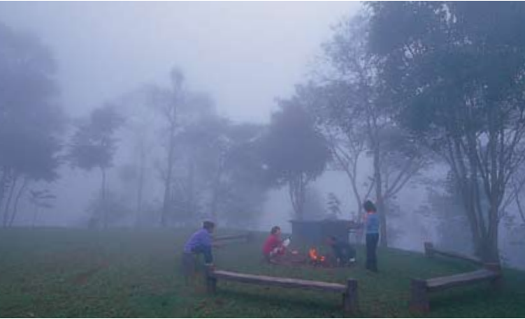
Doi Phu Kha National Park