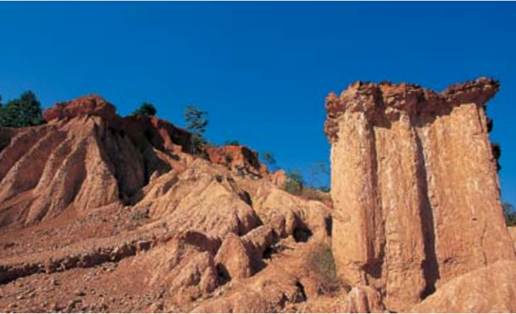
Phae Mueang Phi Forest Park