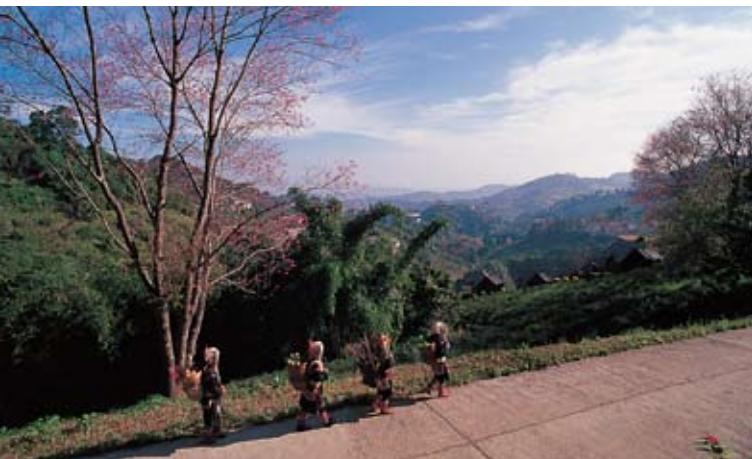
Doi Mae Salong