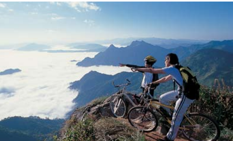
Phu Chi Fa Forest Park

Thong Ngua, a son of King Tilokkarat, the 12 th ruler of Lanna, in 1489. A 1,200-kilogramme Buddha statue was cast. Named Phra Chao Lan Thong, it has a lap width of 2 metres and is over 3 metres high. Another statue called Phra Chao Thong Thip was also cast in brass and in the Sukhothai style.