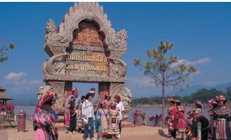
The Golden Triangle

Eight kilometres north of Chiang Saen, this famous riverside spot marks where the borders of Thailand, Lao PDR and Myanmar meet at the junction of the Mekong River and the small Ruak tributary. Boats on the Mekong can be hired for travel upstream from Chiang Saen to the Golden Triangle, or downstream to Chiang Khong.