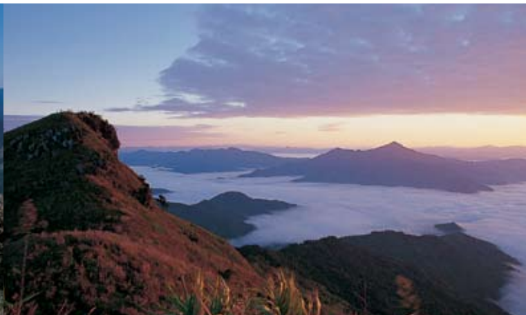
Doi Pha Tang

This mountain, some 25 kilometres south of Doi Pha Tang, is characterised by high, steep cliffs providing a panoramic view over Lao PDR. Its highest peak points out sharply towards the sky. Mist commonly shrouds the mountaintop in the early morning, especially in the cool season. During February, white wild flowers, known as dok siao , dot the area.