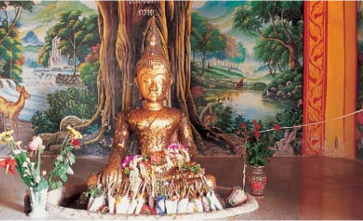
Phra Nang Din