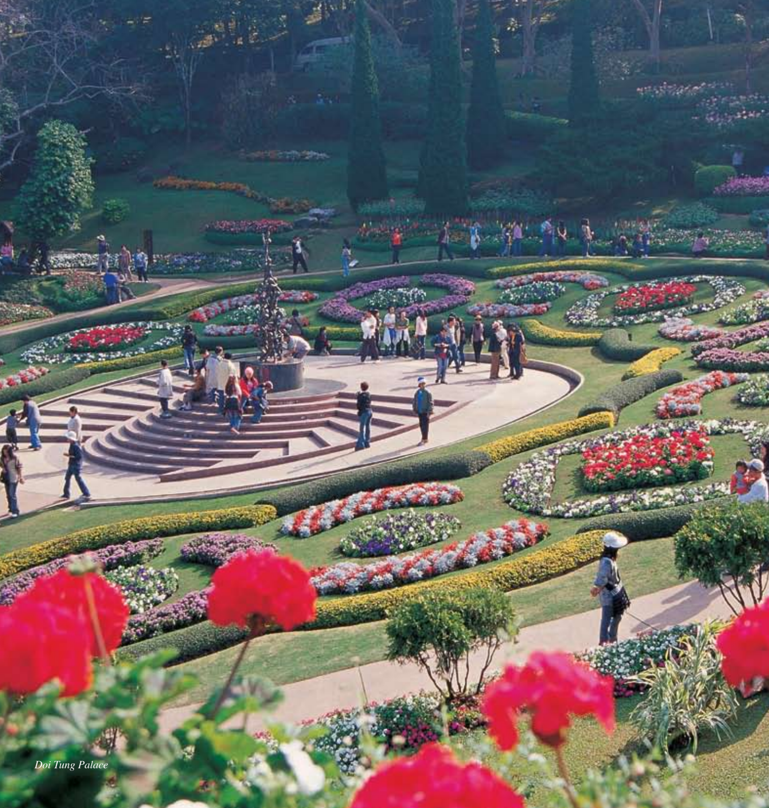
Doi Tung Palace