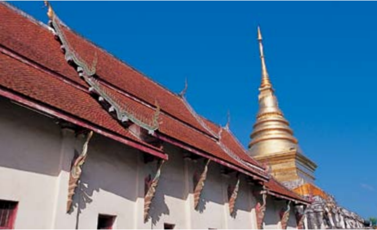
Wat Chang Kham Worawihan

Located opposite the museum, Wat Chang Kham Worawihan was originally built in 1406, subsequently restored several times, and is named after its chedi, which has elephant ( chang ) buttresses around its base. Enshrined at the temple is a superb 145-cm.-high statue of a walking Buddha made of pure gold.