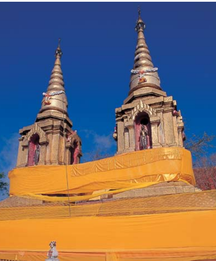
Wat Phrathat Doi Tung