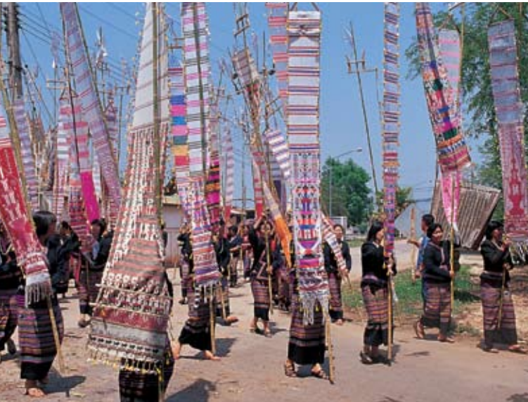
Songkran Festival, Chiang Kham

This national park is 48 kilometres south of Amphoe Dok Khamtai along Highway No. 1251 and 4 kilometres along an access road. A variety of birds flock here, especially peacocks which come to the park area for breeding from January to March. The park also has a scenic waterfall called Namtok Than Sawan. Camping in the park is possible.