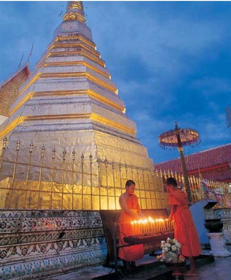
Wat Phrathat Cho Hae