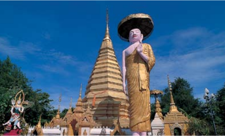
Wat Phrathat Chom Chaeng

Standing 3 kilometres from Wat Phrathat Cho Hae, this temple, built in 788, has a 29-metre-tall golden chedi, which enshrines a holy relic. There is also a museum of rare ancient relics.