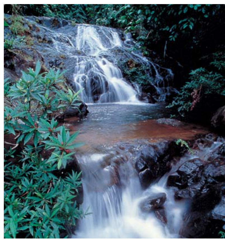
Namtok Khlong Kaeo National Park

Bangkok Airways operates daily flights from Bangkok, taking about 40 minutes. Tel. 0 2265 5555 Website: www. bangkokair.com Most travel agents in Bangkok can book you on a mini-bus, departing from Khao San Road and other major tourist areas. The buses leave between 7.00 a.m. - 8.00 a.m., the