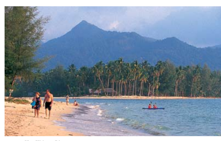
Hat Khlong Phrao

Ban Dan Mai, rubber plantations and orchards to reach this small waterfall. Visiting this crystalline cascade is not recommended during the hot season when it dries up.