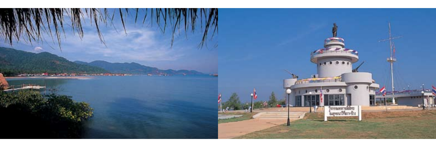
In front off Cliff Cottage, Ko Chang

suitable for swimming. Visitors should also take note that the cape has an excellent spectrum of bargain bungalows and more expensive resorts.